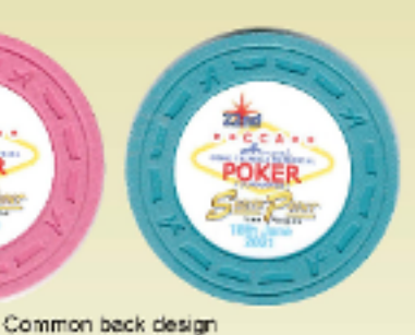
(Silver from and bronze back shown)

2021 Silver/Bronze Convention Medal Sets - $60.00