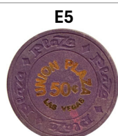
50¢ Union Plaza Las Vegas NV