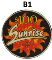
$100 Sunrise Casino Las Vegas NV