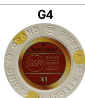
$1 Grand Sierra Resort Reno NV