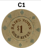
$1 Sam's Town Laughlin NV