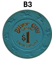
$1 Silver City Casino Las Vegas NV