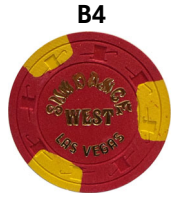
$5 Sundance West Las Vegas NV