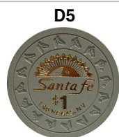
$1 Santa Fe Las Vegas NV