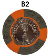
$1 State Line Casino Wendover NV