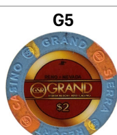
$2 Grand Sierra Resort Reno NV