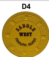
25¢ Saddle West Pahrump NV