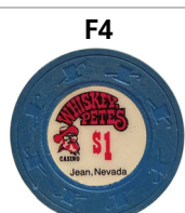
$1 Whiskey Pete's Jean NV