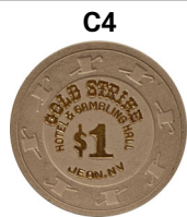
$1 Gold Strike Jean NV