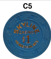
$1 Skyline Henderson NV