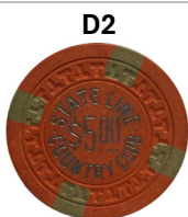
$5 State Line CC Lake Tahoe NV