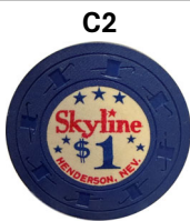
$1 Skyline Henderson NV