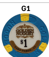
$1 Golden Nugget Lake Tahoe NV