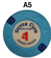
$1 Silver Club Casino Sparks NV