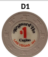
$1 Westward Ho Las Vegas NV