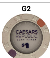
$1 Caesars Republic Lake Tahoe NV