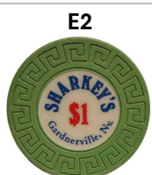
$1 Sharkey's Gardnerville NV