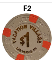
$1 Vacation Village Las Vegas NV