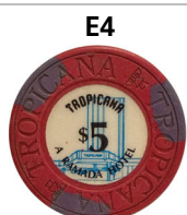
$5 Tropicana Las Vegas NV