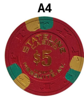
$5 Stateline Casino Mesquite NV