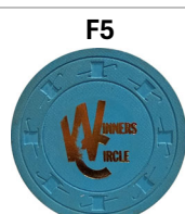
$1 Winners Circle Henderson NV