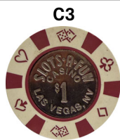
$1 Slots-O-Fun Las Vegas NV