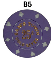
25¢ Sam's Town Laughlin NV