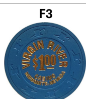
$1 Virgin River Mesquite NV