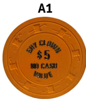
$5 NCV Shy Clown Sparks NV

South Point Casino: Thursday, June 18, 2026