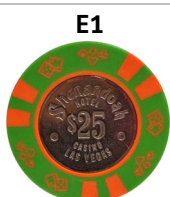
$25 Shenandoah Las Vegas NV