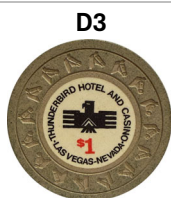
$1 Thunderbird Las Vegas NV