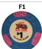
$1 Union Plaza Las Vegas, NV