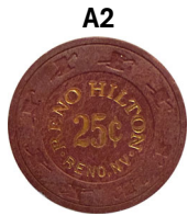
25¢ Reno Hilton Reno NV