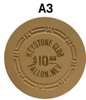
$10 Keystone Club Fallon NV